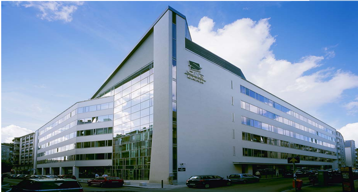
Project : Light Corner Office Building, Budapest Hungary

MORE NATURAL LIGHT. LESS HEAT GAIN. GREATER ENERGY SAVINGS.